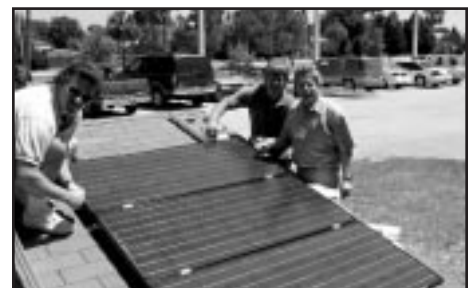
Hands-on training takes attendees through the complete installation process.