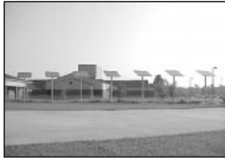
This PV system was recently installed by municipal utility JEA at First Coast High School in Jacksonville.

Eight PV system installation training courses and examinations have been offered, and over fifty installers have been authorized to participate in the Florida buy-down program.