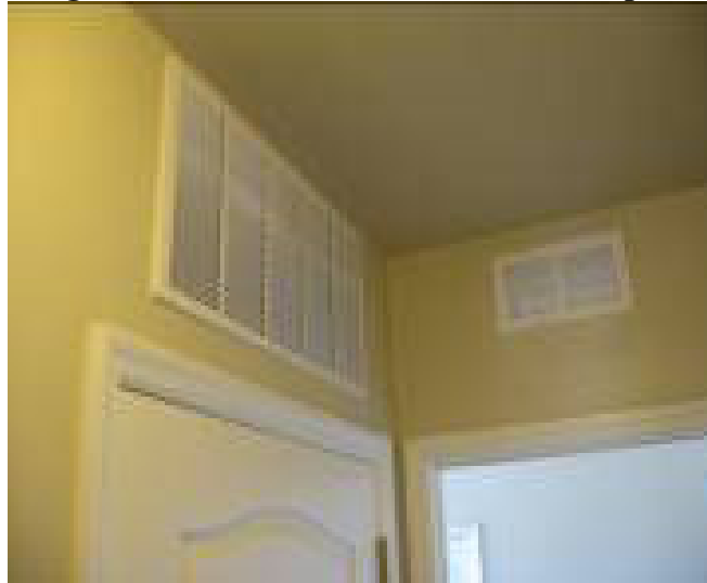
Figure 7. Air Handler in Conditioned Space

Illustrated in Figure 7, the air handler is also inside the conditioned space. It is located behind a door for aesthetics and noise reduction. A large return grill returns the air to the air handler, and an over the door transom is positioned on the right.