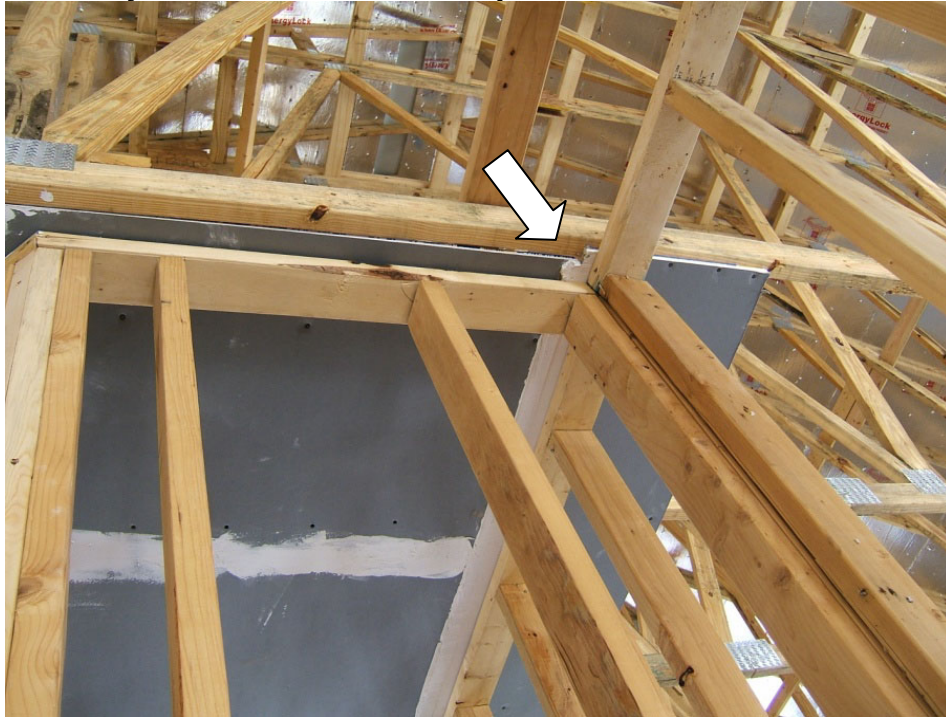
Figure 3. Drywall Installed Between Top Plate and Bottom of Roof Truss

Then the supply ductwork is installed under the drywall after being fabricated and sealed on the ground, as shown in Figure 4. The main supply trunk lines and supply ducts are then hung from the drywall using 2" nylon strapping material. Hard ducts are used whenever possible.