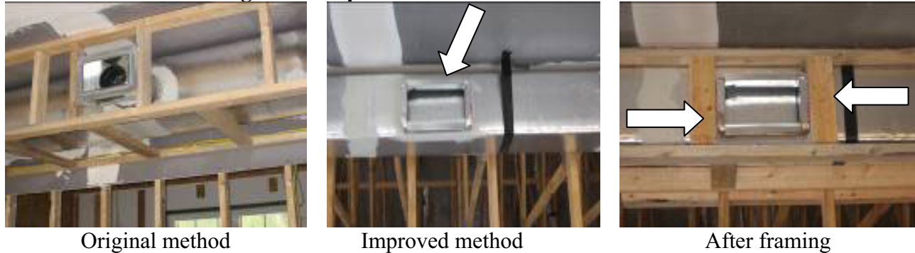
Figure 5. Improved Method for Duct Installation

On the second and final visit of the drywall crew, the sheetrock is installed on the ductwork chase, along with the rest of the home as shown in Figure 6, left. The finished product is pictured at right.