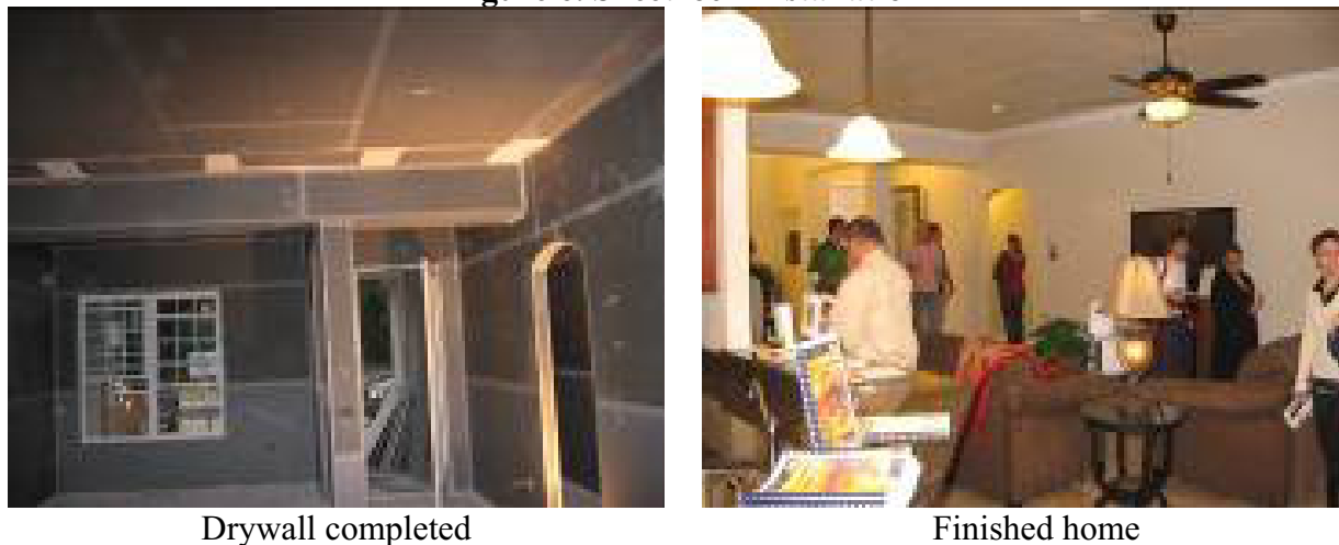
Figure 6. Sheetrock Installation

A key to low costs in one-story homes is the elimination of all return duct work by using over the door transom returns from bedrooms. The transoms must be sized in a manner that ensures that rooms with doors that can be isolated from the main return are maintained under close to a neutral pressure with the home (<2.5 Pascals) when the mechanical system is operating. The returns were sized to be at least 1 ½ times larger than the rooms' cumulative supply duct areas. The supply ducts were sized by Manual D. Another benefit is that by eliminating all ducted returns, labor and material costs are reduced. In addition, the system's overall operating static pressure is reduced, allowing for less wear on the AH fan motor. This measure did not require any alteration to the method that this builder was employing and he has not received any noise or light related complaints in over 100 homes constructed this way with over the door transom returns. Pressure mapping during the final commissioning confirmed that this passive return air system is working as designed. The measured duct leakage to outside was also zero cfm as intended.