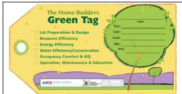
Figure 5. The Home Builders Tag

At the 2008 IBS, BAIHP also initiated a “green tag” that identified the “green” or energy-efficient products and/or strategies throughout the Bimini II and the Glen Cairn. This helped highlight the categories that each product or strategy was applicable to in accordance with NAHB’s green guidelines (Figure 5).