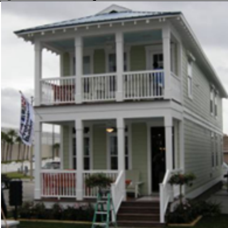
Figure 6. 3,242 square foot Palm Harbor Homes, Bimini II “Green” Home photograph and features at the show