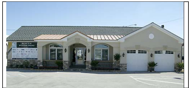
Figure 9. NextGen home at the 2006 IBS

sheathing with taped seams, galvanized metal screw-down shingle, and corrosion-resistant plumbing and fire protection system (Figure 9).