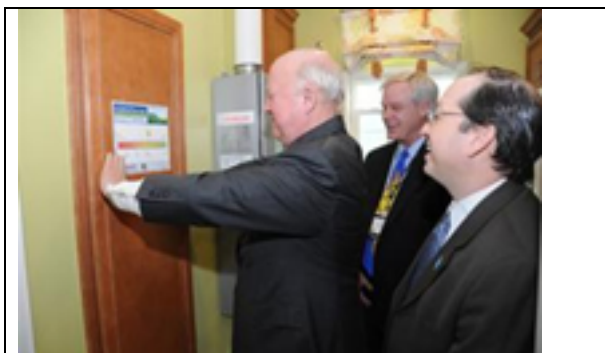
Figure 8. Secretary Bodman places E-scale in Bimini II at the show