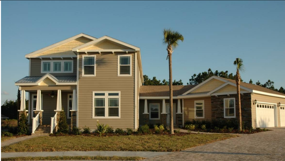
Figure 2. The Bellair with addition permanently located Auburndale, FL