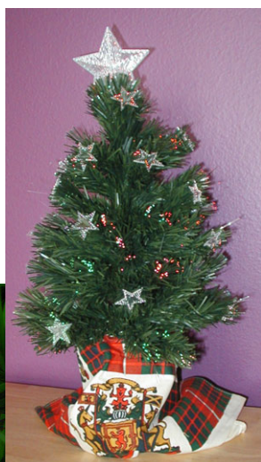
Fiber Optic Tree